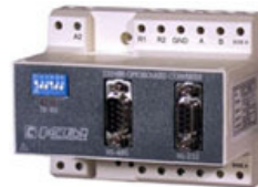
RS 485/232 intelligent converter